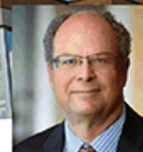
Stuart K. Cohen Real Estate & Business Law