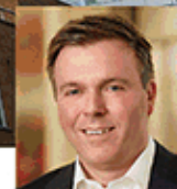
Patrick Foran Real Estate Law

There's a reason we're the go-to law firm when it comes to Condominium and Planned Community Associations in Oregon and S.W. Washington. With real estate and business solutions for developers, volunteer boards, and professional managers of high-rise buildings or subdivisions, we speak your language.