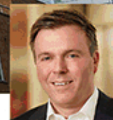
Patrick Foran Real Estate Law

There's a reason we're the go-to law firm when it comes to Condominium and Planned Community Associations in Oregon and S.W. Washington. With real estate and business solutions for developers, volunteer boards, and professional managers of high-rise buildings or subdivisions, we speak your language.